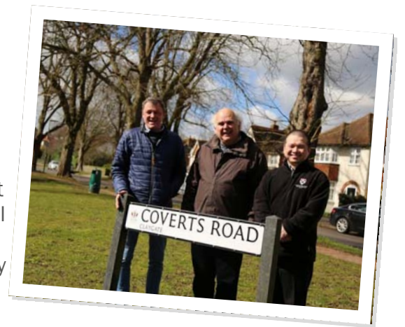
Working together to get our roads and pavements repaired

We remain concerned about the state of our roads, footpaths, gullies and drains. Partnering with Mike, our County Councillor, we ensured that many Claygate roads were included in the £100 million Surrey County Council (SCC) project to resurface many of our worst, well travelled residential streets. Coverts Road, Common Road, Foley Road, Aston Road and The Avenue have been repaired. We are pleased that after pressure, SCC have announced a new £20 million dedicated programme to improve pavements. We expect utility companies to live up to their responsibilities and in particular we will continue to pressurise Thames Water to ensure that water leaks and drainage repairs in our roads are responded to and sorted quickly.