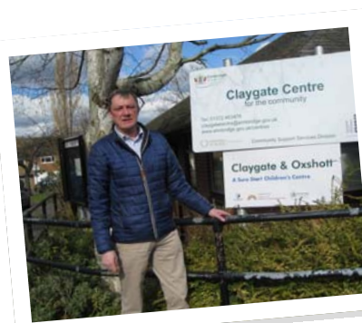
Support our crucial voluntary services