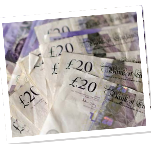
Spend taxpayers money wisely to deliver the best services

Your local Conservative led borough council has achieved savings of over £10 million in the past seven years and a zero borough Council tax increase in seven out of the last 10 years. It has increased funding for the voluntary sector, worked closely with partners to provide in excess of 1000 affordable homes and reviewed all key contracts. We will ensure that the borough Council tax paid by Claygate residents is spent wisely so that each penny works as hard as it can to deliver the best possible services.