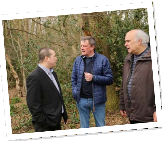
Determined to preserve our Green Belt and open spaces

Claygate is a green and pleasant place in which to live and work - we want to keep it that way. We will work to influence the Elmbridge Local Plan in order to conserve our Green Belt, enhance protection for our open spaces, such as the Recreation Ground and 'Old Village Green' by the Hare and Hounds and to protect our trees and woodlands. We need new homes, but we will not support inappropriate development and we will push for faster, stronger Council enforcement against unlawful development.