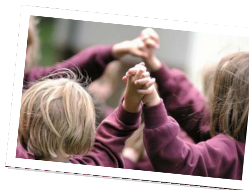
We will seek more local, accessible school places