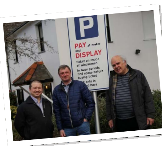
We will defend our Village car parks

Our two Village car parks are vital community assets and we will oppose any plans either to sell them or to introduce charging on Sundays. Torrington Lodge behind the Co-op and Hare Lane by Champions are owned by Elmbridge Borough Council (EBC). We will engage with other Villages in the borough to lobby for one hour free parking in Village car parks - consistent with the one hour free on-street parking on The Parade and Hare Lane slip road.