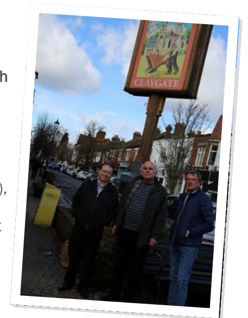
We will promote our community organisations and local businesses

We will always put the interests of Claygate first and continue to partner with and champion our many community organisations that work so tirelessly on behalf of our Village. We aim to ensure that our local businesses can take full advantage of schemes such as the Elmbridge Civic Improvement Fund (ECIF), a business grant scheme which offers money to local businesses to help attract more people to the area and boost the local economy. To date the fund, established by the Conservative led Council has provided over £1 million to local businesses and projects. An example being funding towards replacement heritage style lamp posts on The Parade.