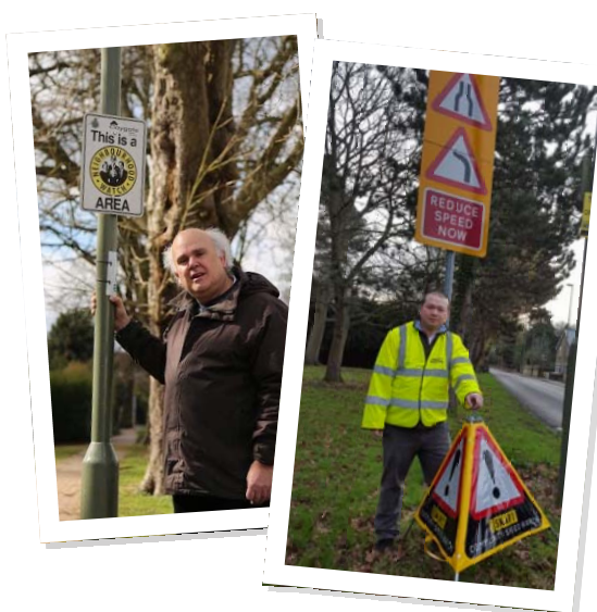
Partnering with our local police to make Claygate even safer

We will continue to partner with our local police, as they tackle crime and anti-social behaviour, to make Claygate even safer. Surrey Police are undergoing reorganisation and safer neighbourhood teams will become smaller. We want to ensure that our police continue to understand and act on local concerns and needs and that they retain a critical link to our community. We will do our best to assist, including supporting Neighbourhood Watch and Speed Watch.