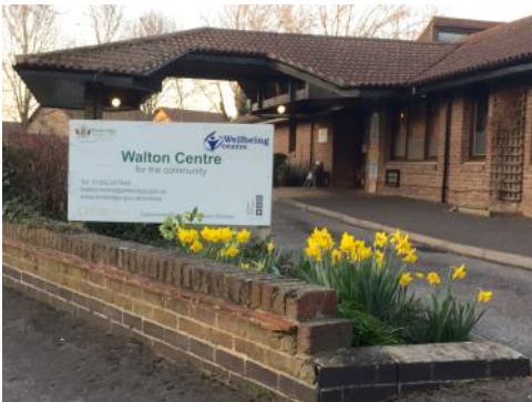
Walton Day Centre in Manor Road

It's even worse for community transport users. A single journey to a Day Centre will cost a whopping 30% more from January, and the average rise for transport is over 13%. Another service charge was also hiked by 14%.